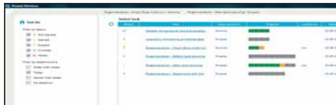
Figure: The Powel Nimbus task list

Each watercourse has different specialties that need special attention. With Powel Nimbus, you have the flexibility to design the user interface for each watercourse focusing on the most important aspects. For each step in one task, the customer can configure Powel Nimbus to show appropriate views securing the right focus on the right data.